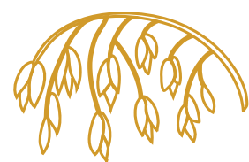
Sorghum (a type of grain used to make porridge)