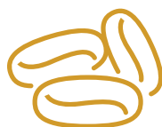
Ground nuts (peanuts)