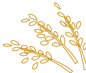
Millet (a type of grain that is used to make flour)